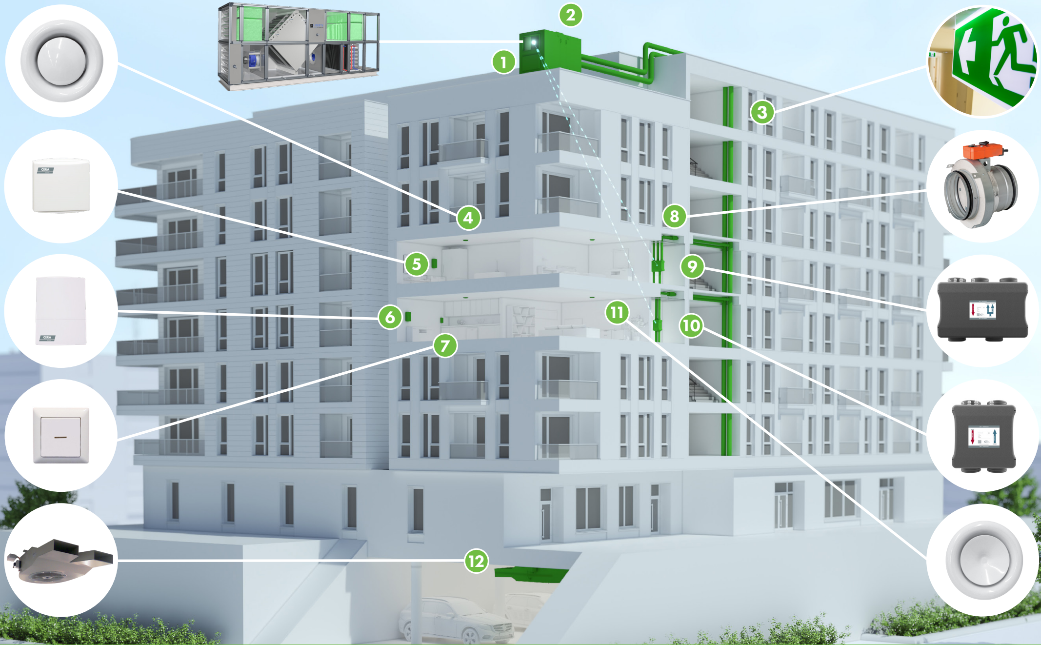
1. CONTROL PANEL | 2. AIR HANDLING UNIT | 3. STAIRWELL PRESSURISATION SYSTEM | 4. RETURN VALVE | 5. HYGROSTATE | 6. CO 2 -SENSOR 7. SWITCH | 8. FIRE DAMPER | 9. CERA-UNIT TYPE 2 | 10. CERA-UNIT TYPE 1 | 11. SUPPLY VALVE | 12. CAR PARK VENTILATION SYSTEM